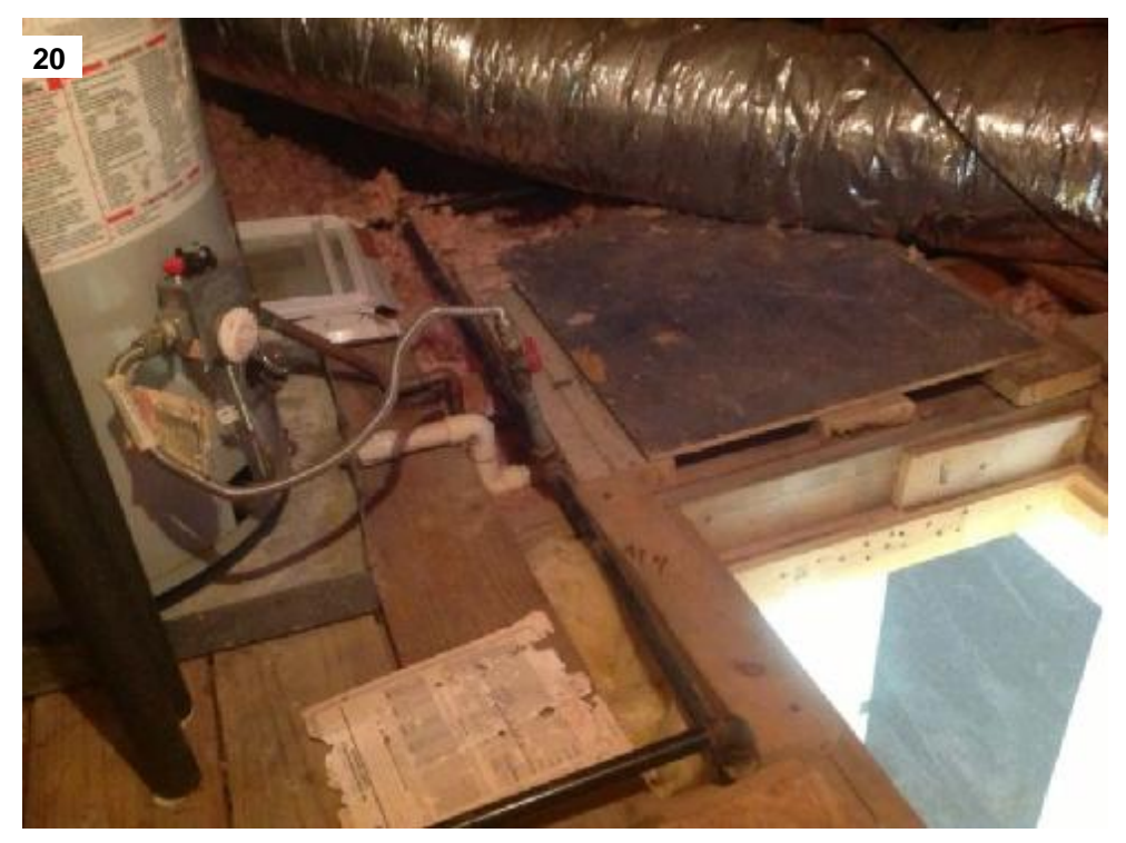
improper working platform in front of water heater