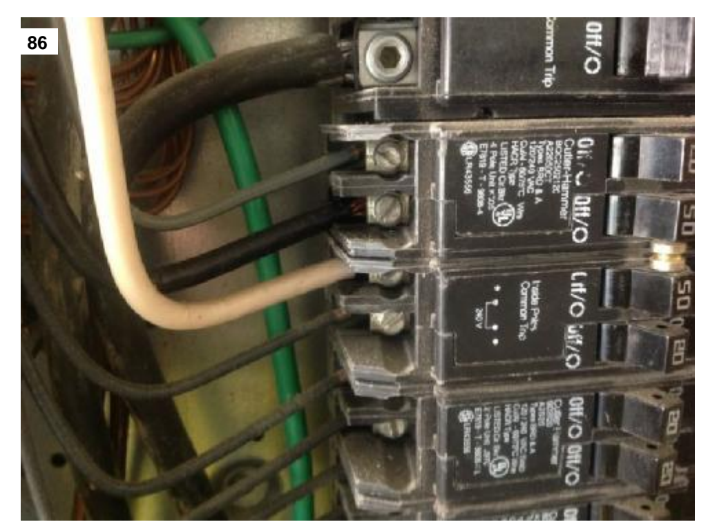
Neutral wire used as hot wire