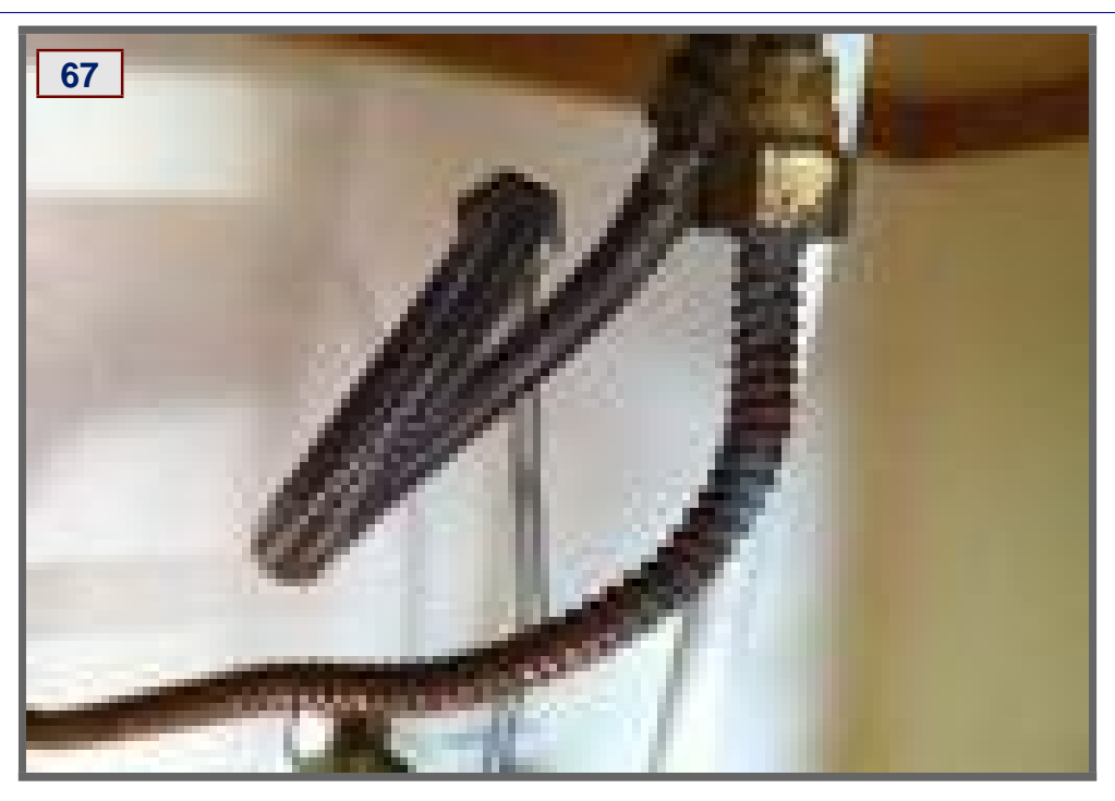
Master Bathroom Signs of past leaks/corrosion at drain lines under sinks. Noted Micro leek (2) See Photo # 67

Inspection Date: July 12, 2012 Inspector: Inspectors Name