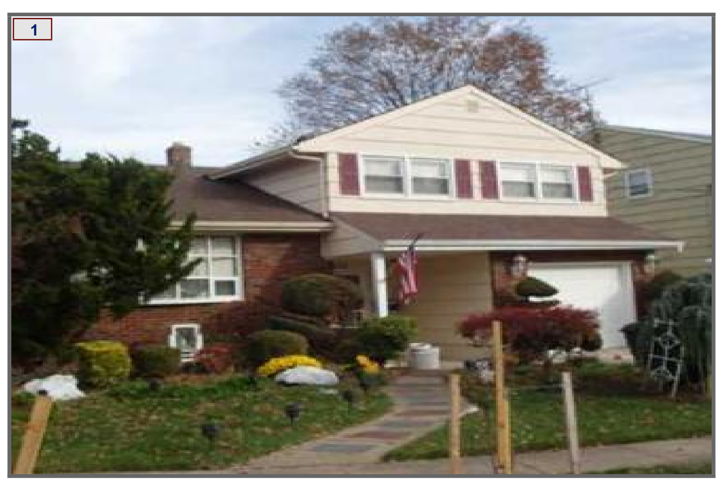
View from Street

Your Company Address Tampa Florida 32569 850-737-1234 inspector@gmail.com