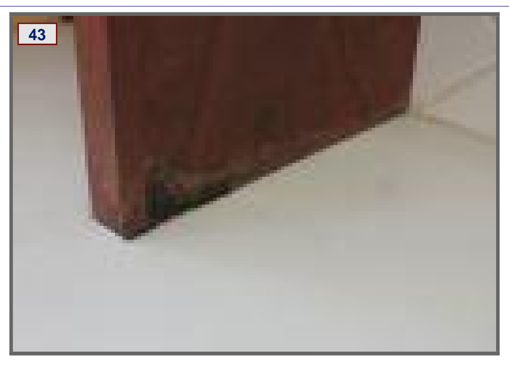
Hall Entry Door Water stain

Your Company Address Tampa Florida 32569 850-737-1234 inspector@gmail.com