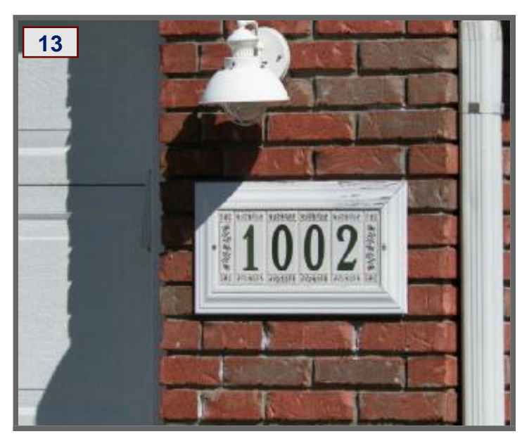
Front Light Bulb missing

Your Company Address Tampa Florida 32569 850-737-1234 inspector@gmail.com