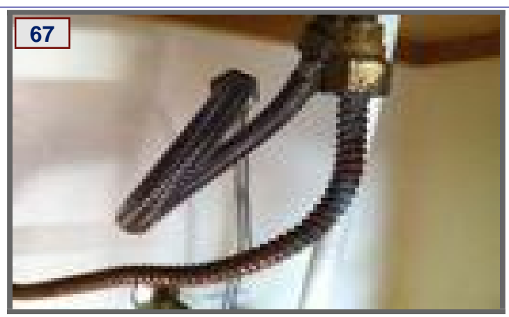
Master Bathroom Signs of past leaks/corrosion at drain lines under sinks. Noted Micro leek (2) See Photo # 67

Your Company Address Tampa Florida 32569 850-737-1234 inspector@gmail.com