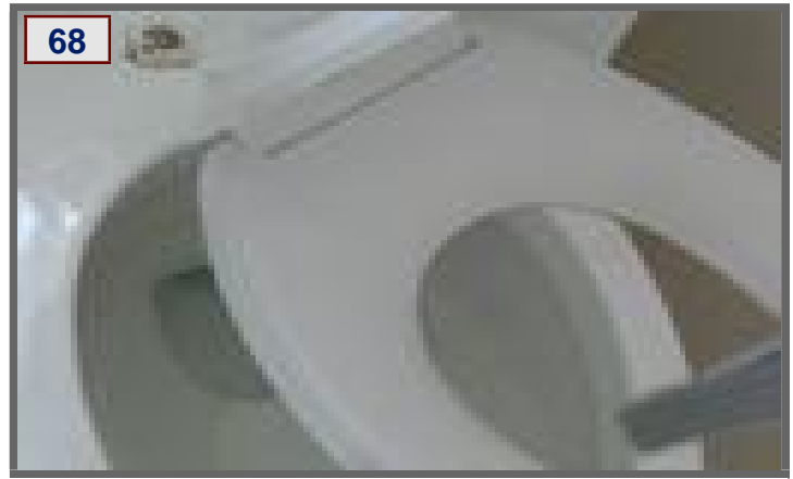
Master Bathroom Toilet: Seat Needs Adjustment / repair required to Operate properly (2) See Photo # 68