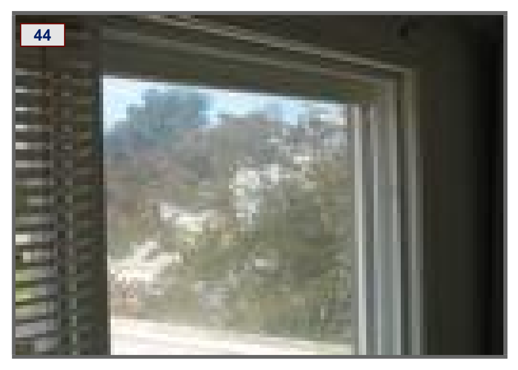
View of broken window glass at Master bedroom