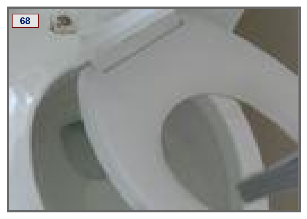
Master Bathroom Toilet: Seat Needs Adjustment / repair required to Operate properly (2) See Photo # 68