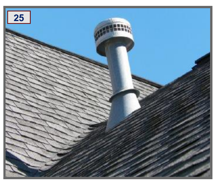
Shingles need secured & sealed at one or more locations.

Your Company Address Tampa Florida 32569 850-737-1234 inspector@gmail.com