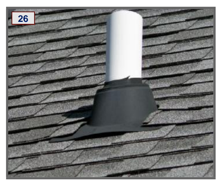
Shingles showing signs of weathering & age.