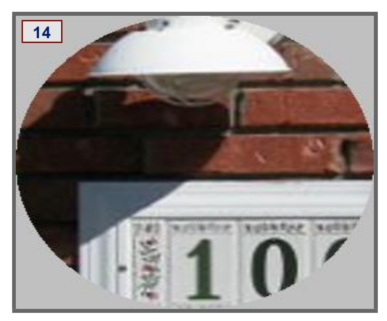
Front Light Bulb missing