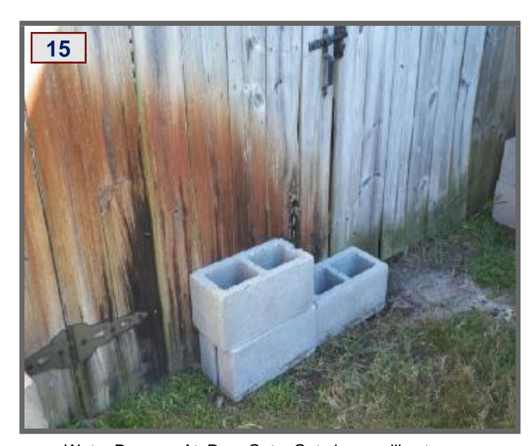
Water Damage At: Rear Gate, Gate loose will not open.