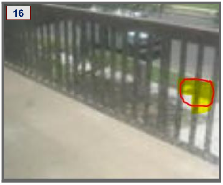
View of Exterior railing opening 7-8 inch