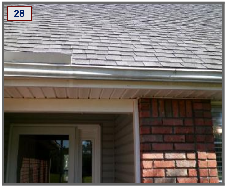
Gutters Damaged and lose.