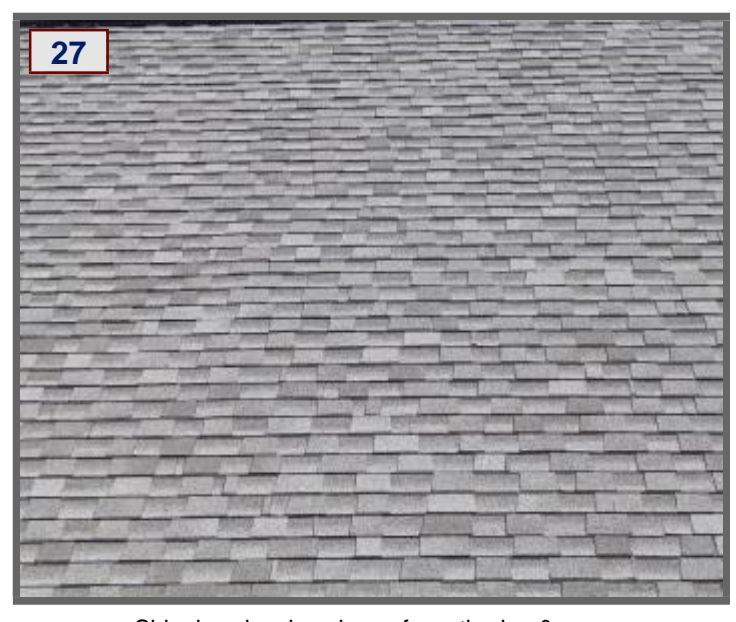
Shingles showing signs of weathering & age.