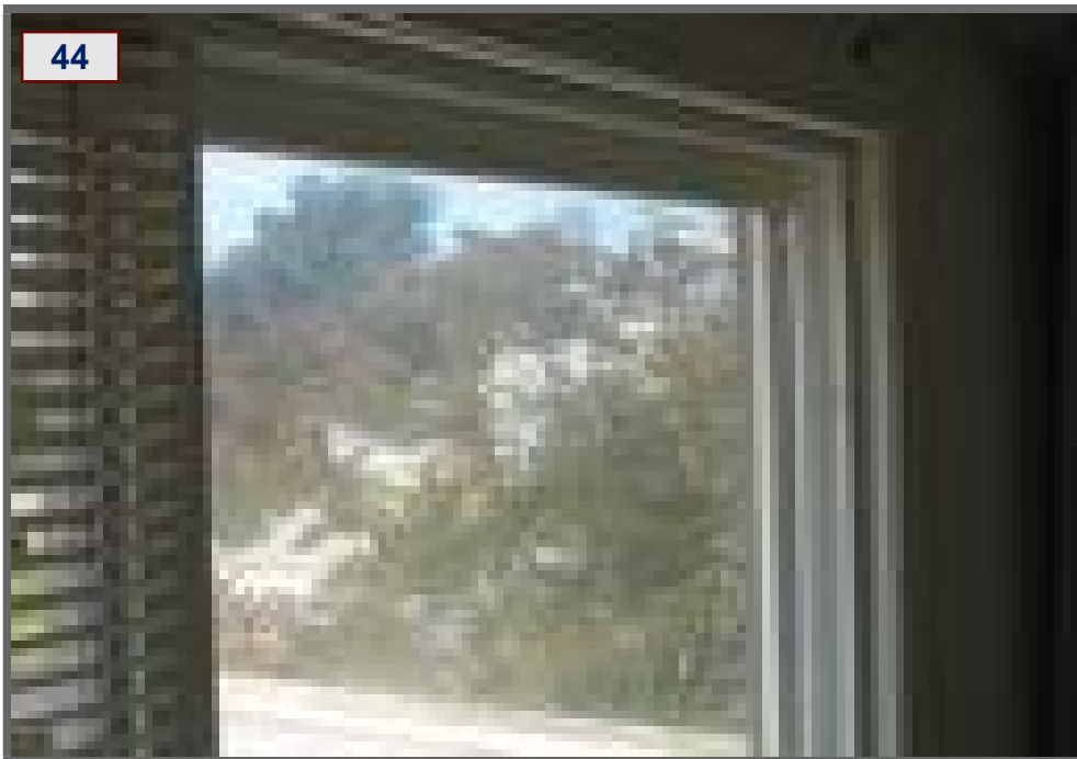
View of broken window glass at Master bedroom