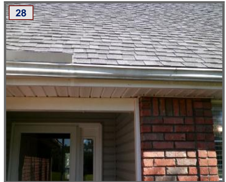
Shingles showing signs of weathering & age.