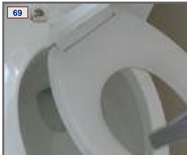
Master Bathroom Toilet: Seat Needs Adjustment / repair required to Operate properly (2) See Photo # 69