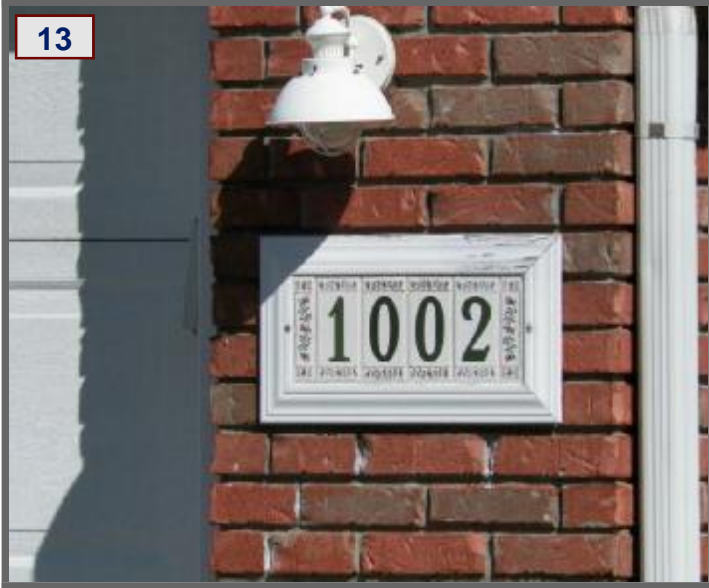
Front Light Bulb missing