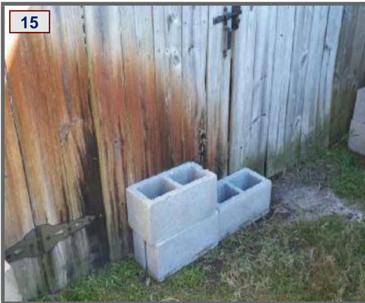
Water Damage At: Rear Gate, Gate loose will not open.